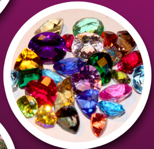
Gems & Jewellery