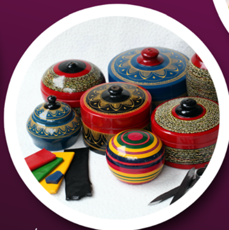
Handicraft and Antiques